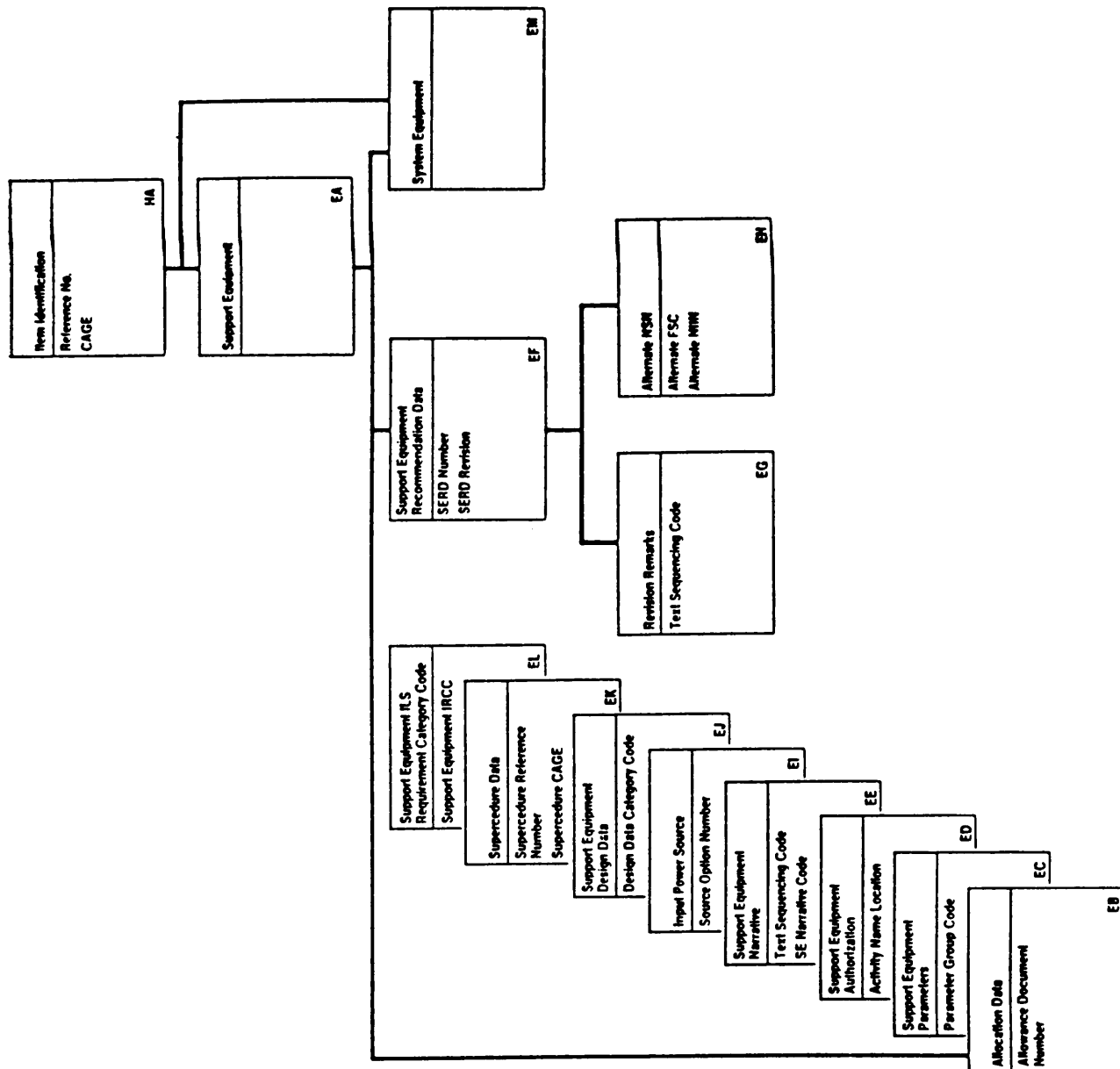
FIGURE 8. E table relationships.